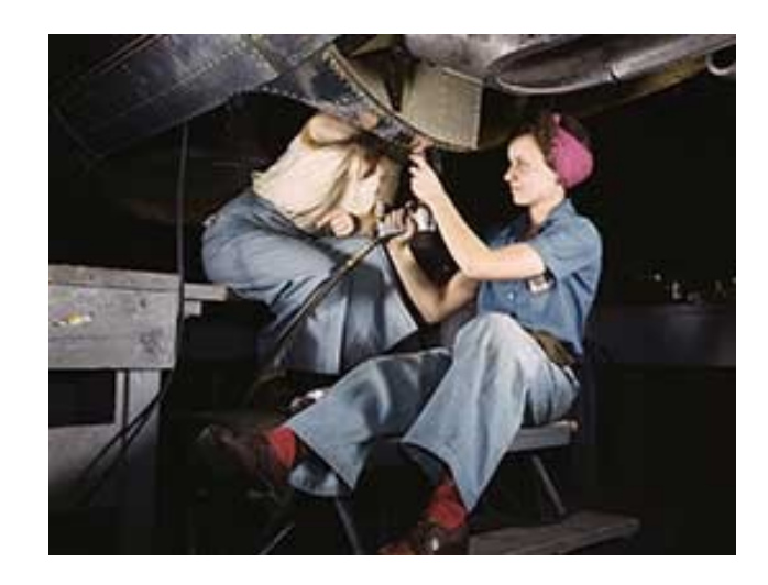
Women at work on bomber, Douglas Aircraft Company, Long Beach, Calif.