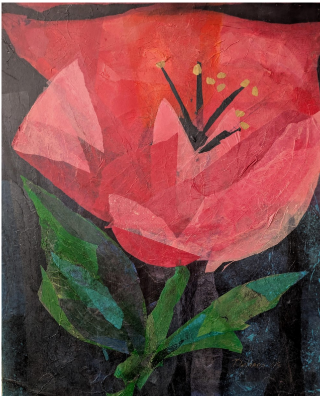
Example—Tissue Paper Flower

Two techniques will be taught. One technique is how to use tissue paper to make watercolor prints. The other technique is painting by using bleeding tissue paper and glue and building your design through layers of tissue paper. Bring half inch brush, Elmer's glue, gloves, a throwaway containers for water, scissors, heavy paper, cardboard or canvas any size for your work. Some materials will be available.