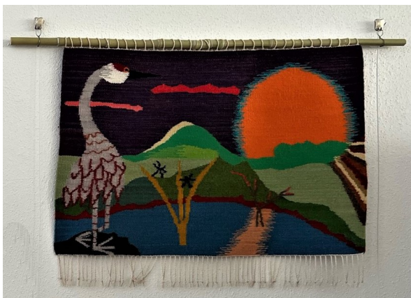
Crane and the Harvest Moon, Hilary Hyle (Unitarian exhibit)