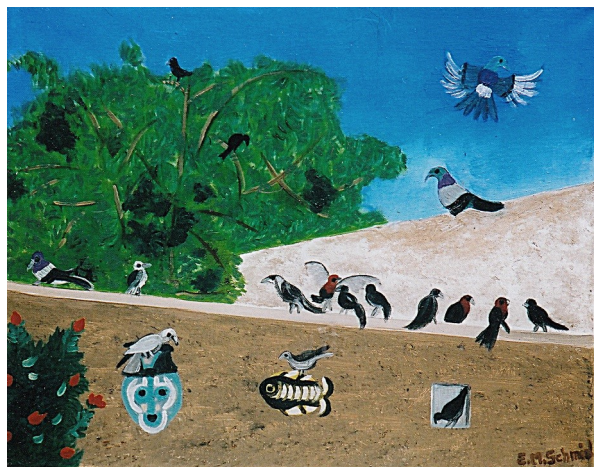
Eliza Schmid, Active Birds in Spring