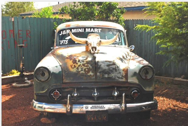
Hood Ornament, Route 66

Newsletter deadline is the 1st of each month. Submit your news to joanf41@gmail.com . News can be added at any time on the website.