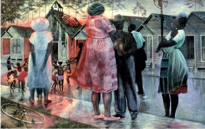
John Biggers, Shotgun, Third Ward #1, 1966, tempera and oil, Smithsonian American Art Museum, Museum purchase made possible by Anacostia Museum, Smithsonian Institution.

African American Art in the 20th Century continues at the Albuquerque Museum through Jan. 19, 2014