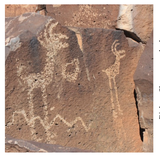
Bighorn Sheep petroglyph Photo on panel with cold was Joan Fenicle

Newsletter deadline is the 1st of each month.