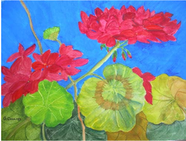
Red Geraniums, Grace Collins