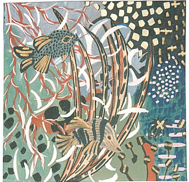
Corral Reef 1, Eliza M. Schmid Egg tempera on panel, 12x12

Joan Fenicle shares that 2021 will see her 80th birthday—and she is thinking that deserves something special ... a retrospective show perhaps or just indulging in an adventure, assuming we are able to do that again in 2021. In her younger days, adventure would mean a backpack and some topo maps, but at almost 80, a new luxury train option from Denver to Moab is getting a second look. A new camera and some dirt roads are hopefully on the horizon for summer.