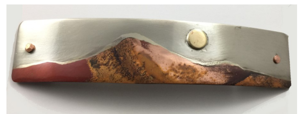
New work, Sue Pine