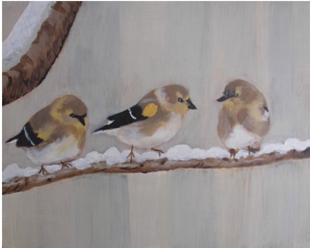
Leslie Kryder, Finches Acrylic, 8x10”