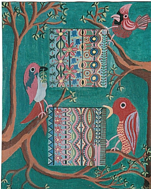
Eliza Schmid “Decorations Unwelcome by Birds” egg tempera on panels collaged on canvas, 20x16”