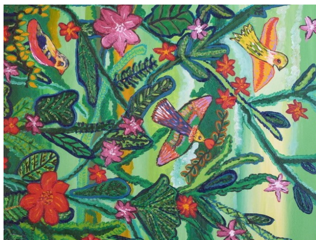
Angela Storch, acrylic