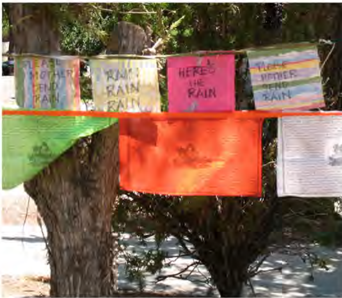
Flags of Prayer for Rain