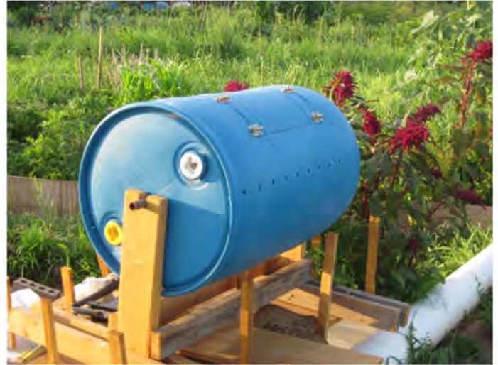
Compost barrel