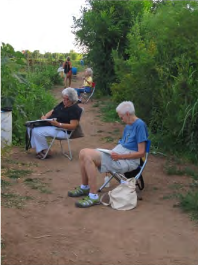
Sketching at the Farm