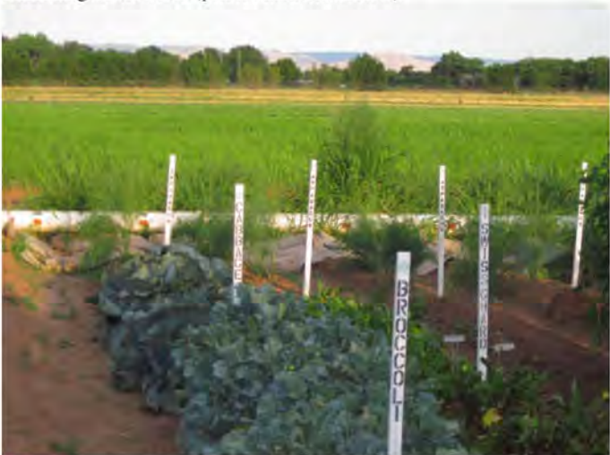
Master gardens & view of Los Poblanos field