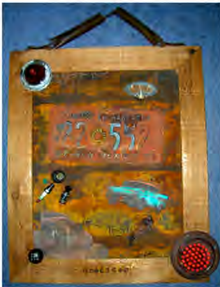
"DESCANSO" mixed media construction by Gloria Hajduk wood, vintage car interior, taillights, gear shift knob, spark plug, cigarette lighter, gasoline gauge, spring, license plate, toy tire, paper and nail polish.

Rainbow Artists 1508 Roma NE Albuquerque NM 87106 www.rainbowartists.com