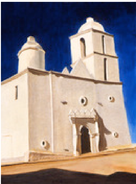
San Ignacio de Caboria by Barbara Fried

Rainbow Artists 1508 Roma NE Albuquerque NM 87106 www.rainbowartists.com