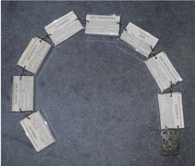
Bible Belt , by Gloria Hajduk , plastic, metal, paper