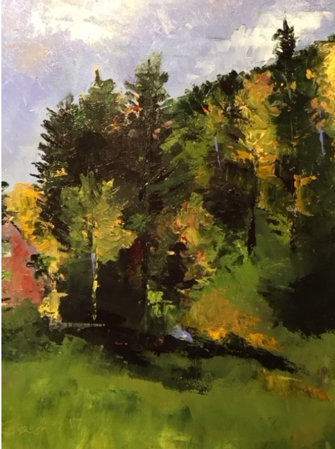
Turning Leaves Water Soluble Oil Paula Stern