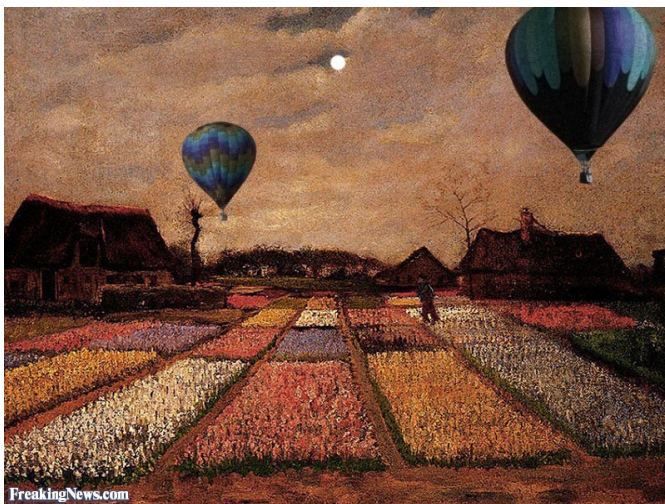
Van Gogh painting with balloons

Newsletter deadline is the 1st of each month.