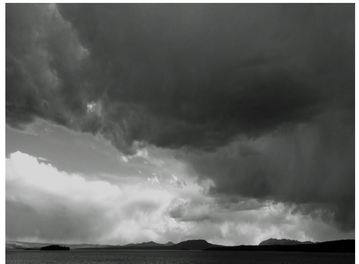
Incoming over Lake Yellowstone, Janine Wilson

Contemplating the stillness of the beaver pond, Silence suddenly shattered, Tail on Water, Warning given.