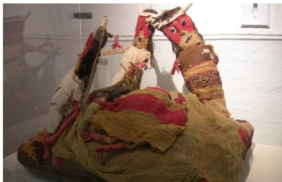
(Burial dolls, Peru)

If you have dolls from other cultures, please bring them or images of such dolls you are interested in to the meeting. This discussion may give us even more ideas for the spirit dolls we are working on.