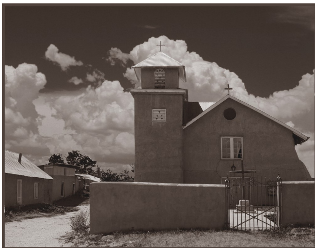
Nuestra Señora del Rosario, Truchas

Newsletter deadline is the 1st of each month.