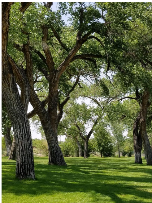
A view of Kit Carson Park ... looks like a lovely spot for a summer picnic.