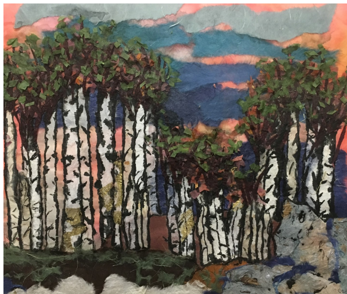
Image of her rice paper collage, titled First Leaves that sold at Napoli is attached.

After a simple exercise to help each participant access energies/images rising from her unconscious, participants will have the opportunity to play with building a collage using various art papers.