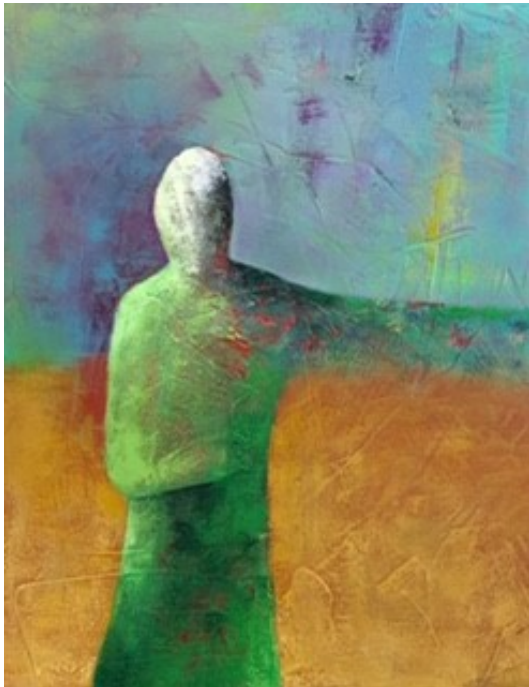
Boundless by Sue Pine

Rainbow Artists 2200 Lester NE, Apt 378 Albuquerque, NM 87112 www.rainbowArtists.com