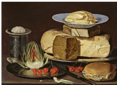
Still Life with Cheeses, Artichoke and Cherries by Clara Peeters

The Guerrilla Girls agree that increasing solidarity among excluded artists is key. Indeed, their quarter century of work is a testament to feminist organizing and the joy that comes from collective resistance. Furthermore, they've been inspired by Spain where a new law mandates gender equity in all cultural institutions. If Spain can require parity, so can other places they argue.