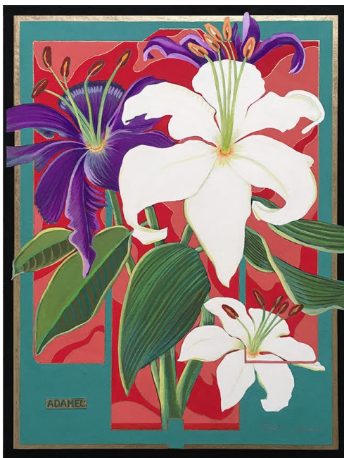
Red Kimono, Mixed Media, 16 x 12

Rainbow Artists 2200 Lester NE, Apt 378 Albuquerque, NM 87112 www.rainbowArtists.com Newsletter deadline is the 1st of each month.