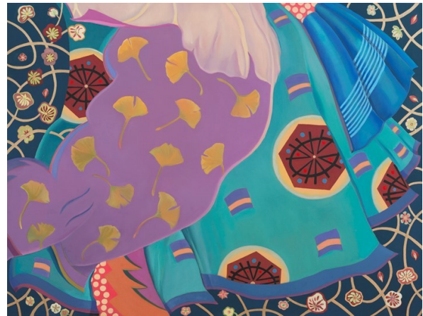
“Kimono Swing 2”, oil on stretched canvas, 36” x 48”

Here’s a sneak preview of one of my new paintings for the show.