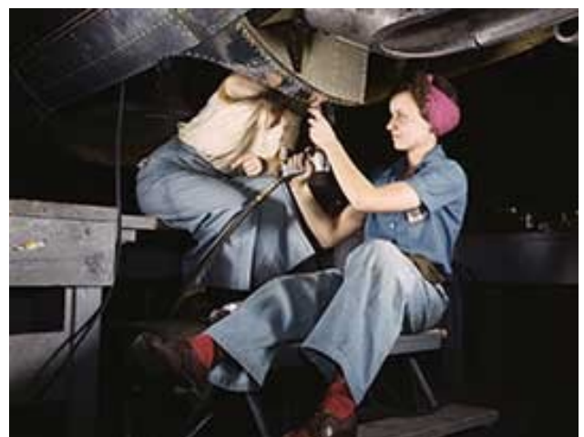
Women at work on bomber, Douglas Aircraft Company, Long Beach, Calif.