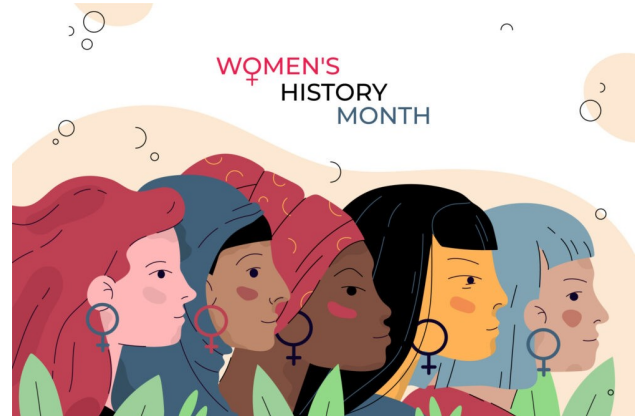
Celebrate women throughout history.