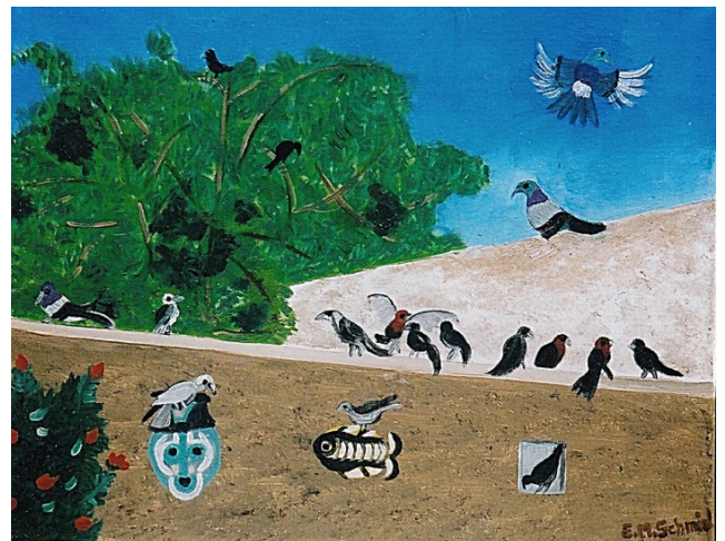
Active Birds in Spring, Eliza Schmid