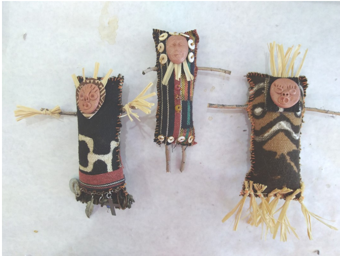
Ginger Quinn's Spirit Dolls