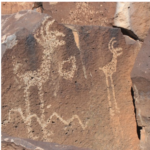
Bighorn Sheep petroglyph Photo on panel with cold was Joan Fenicle

Newsletter deadline is the 1st of each month.