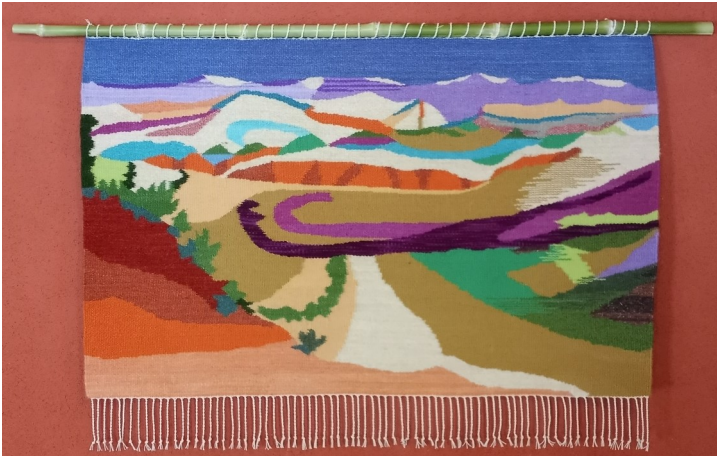
Hilary Hyle: Early Morning in the Escalante