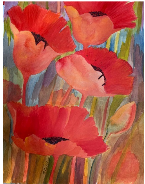
Grace Collins: Popping