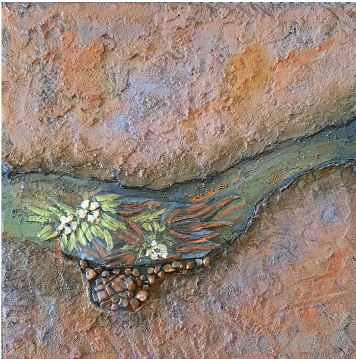
Joan Fenicle: Alpine Beauty , mixed media on birch panel